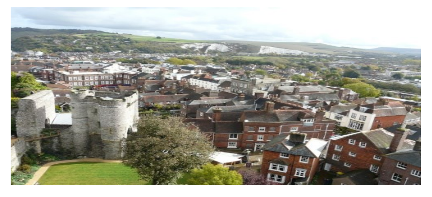
The town of Lewes in England with the Castle in the foreground. I lived just to the right of the picture

I was not a good student, always being placed at the bottom of the class but must have pulled myself together as I received the equivalent of a high school diploma, issued by Oxford University, which refers to passes being achieved in English, English literature, history, mathematics and, believe it or not, religious knowledge. At that point I decided against going to University but took the entrance exams toward taking articles in my father's accounting practice. This led me to a career in Corporate Recovery initially with the British Government's Insolvency Service and later in private practice. By the 2001 I was the senior partner of one of the largest London firms dealing with distressed businesses. I was also divorced but had two lovely children. (continued inside back page)