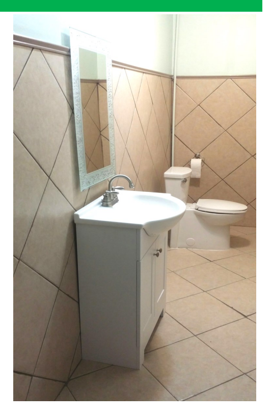
The re-styled Walker Hall Restroom

The restroom near the Walker Hall kitchen is almost completed. The plumbers and electricians will be at Central the week of November 2nd to install equipment that will furnish hot water in the kitchen, the Walker Hall restroom, and (say a prayer) hot water in the restrooms on the first floor of the Educational Building.