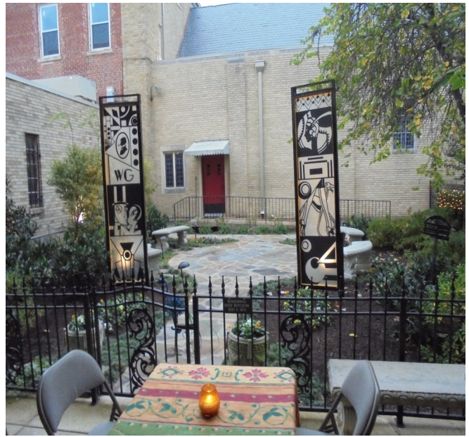
The "Avant-Garde" panels, used to decorate the Chapel Garden, served as a sophisticated background to the outdoor dining area.