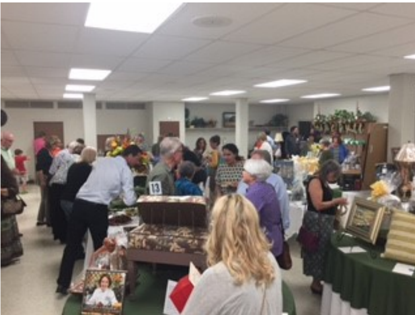
Some of the attendees enjoying the event