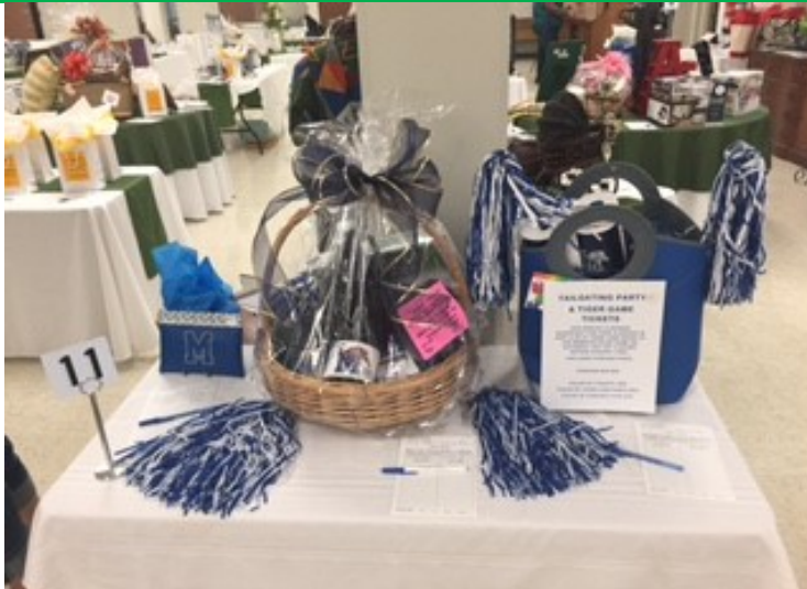
Lots of great Silent Auction Items, do we have any University of Memphis Fans here?