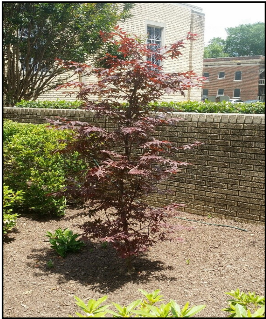
“A Tree Grows In Chapel Garden”