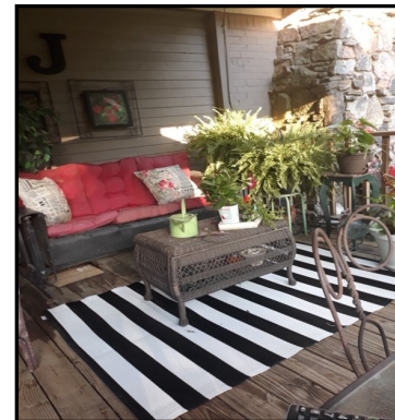
Linda's lovely porch