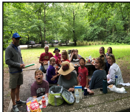
Picnic time for the Russell clan