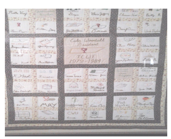
A production of the Quilting Group that is on display in our Fellowship Hall.