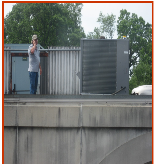
Here we have one of the workers with the unit calling the office for the instruction book on how the put in the unit!