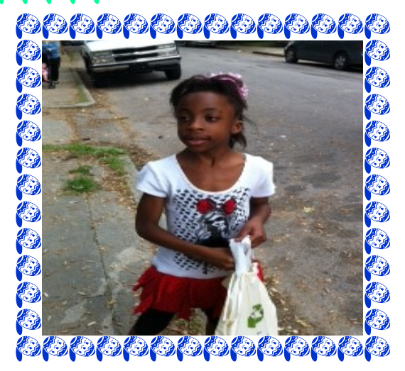
No! It's more fun to find the egg than eat it!