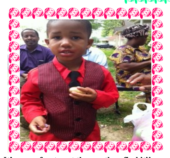
It's more fun to eat the egg than find it!!