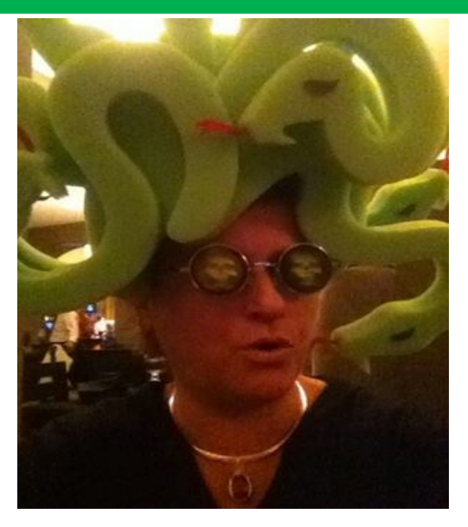
No prizes for guessing who this is!