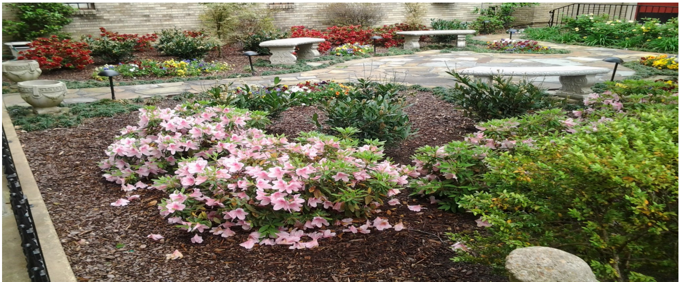
The Chapel Garden now that Spring is here.

That is the Good News that we must never forget. That is the Good News that we are commissioned to share. Lets get to it!