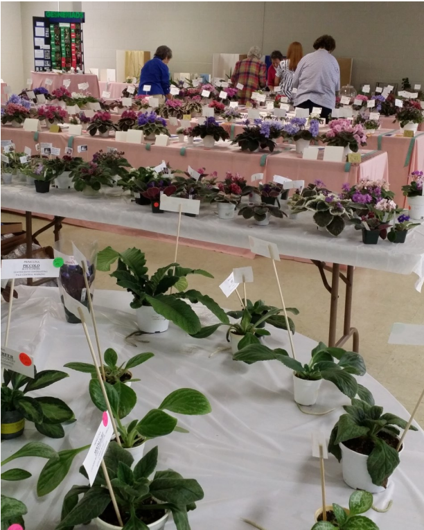
African Violets Society held their Annual Flower Show and Sale