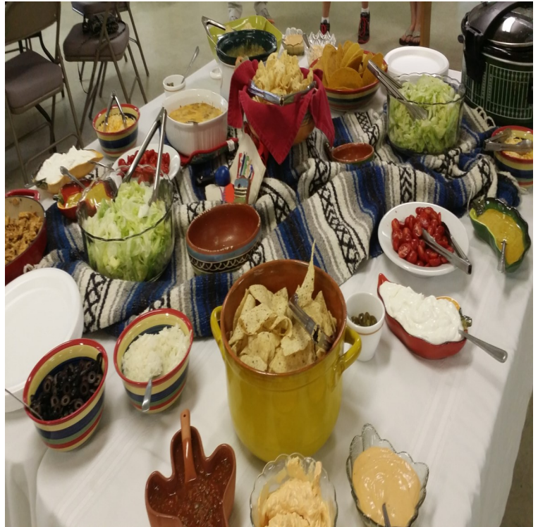
Cinco de Mayo Dinner