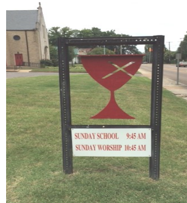
Our new signage