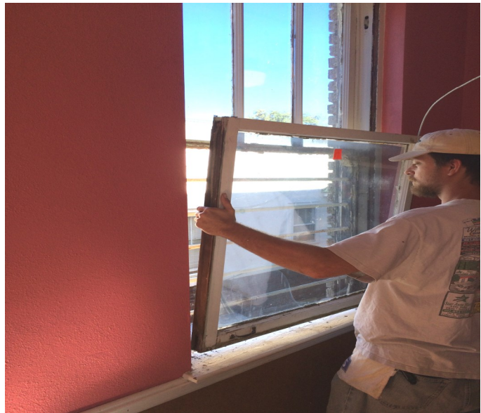
Out with the old.

Where do we go next, the parking lot maybe!