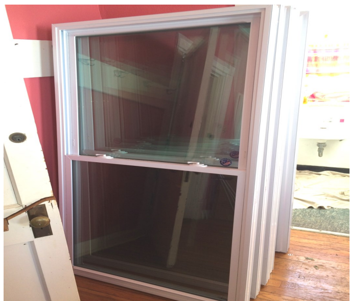
And in with the new