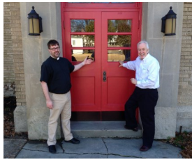
January: Restoration of the Peabody entrance