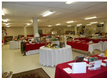
October: Who can forget our most successful Autumn Evening Auction and Tasteful Treasures Sale ever