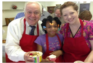
July: Ice Cream Social