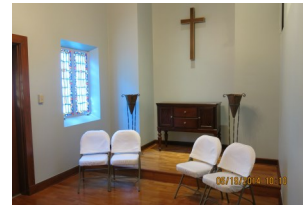
May: Completion of the Wedding Chapel