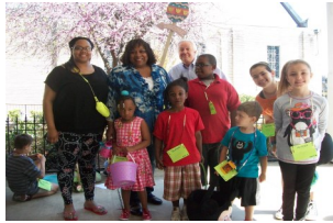
April: Left the Easter Egg Hunt and on the right are some of the men of the Church in deep contemplation at the Men's Auxiliary Annual (we hope) Retreat.