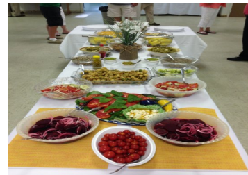
August: Vegetable Dinner