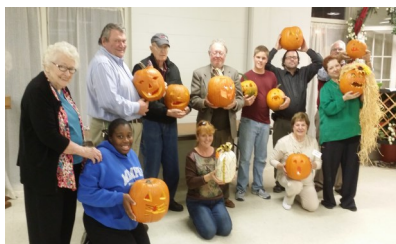
November: Pumpkin Carving Competition and our free winter Clothing Closet