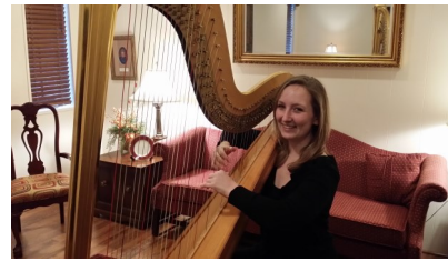
March: Church was host to Young Musician of the Year Competition organized by the Beethoven Club