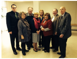
February: Souper Sunday Cooks