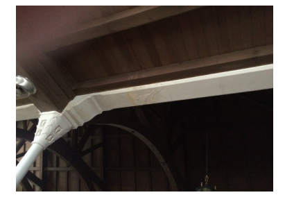
Some of the water damage in the Sanctuary