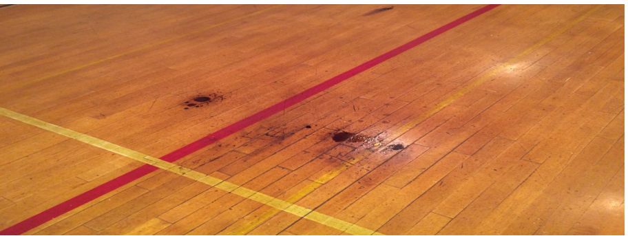
Water stains on the basketball court floor.