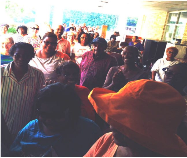
The crowd waiting to come in at the start of the Sale