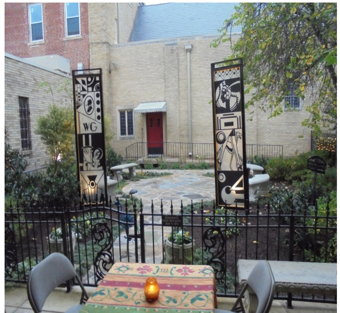
The “Avant-Garde” panels, used to decorate the Chapel Garden, served as a sophisticated background to the outdoor dining area.