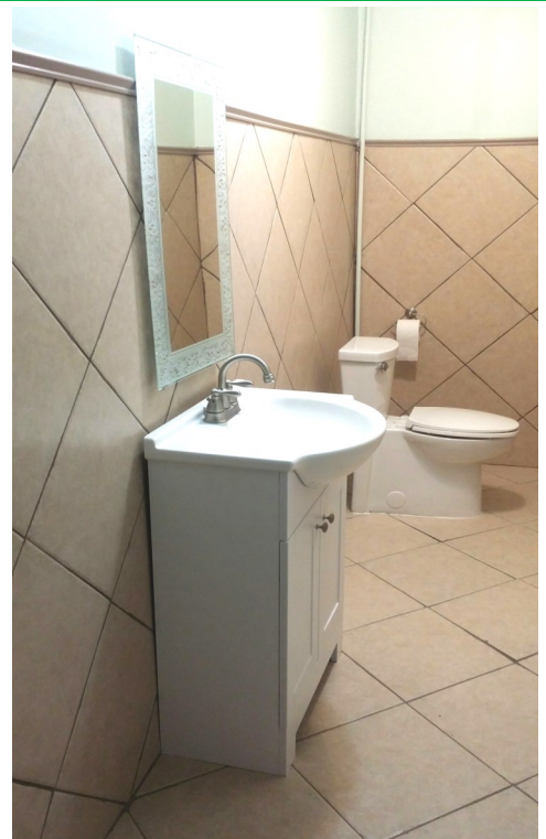
The re-styled Walker Hall Restroom

The restroom near the Walker Hall kitchen is almost completed. The plumbers and electricians will be at Central the week of November 2nd to install equipment that will furnish hot water in the kitchen, the Walker Hall restroom, and (say a prayer) hot water in the restrooms on the first floor of the Educational Building.