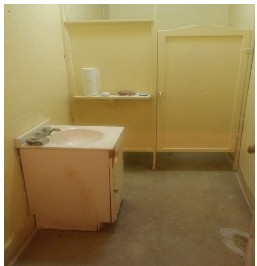
The Walker Hall restroom before the renovations started. Outdated and uninviting to visitors.

Not to be left in the dark, several of the lights in Walker Hall and the Walker Hall stairwell are being replaced with more up-to-date, energy saving lights. The outside parking lights, which go out after a year or so, are also being replaced with energy saving lights - which are brighter than the ones currently used.