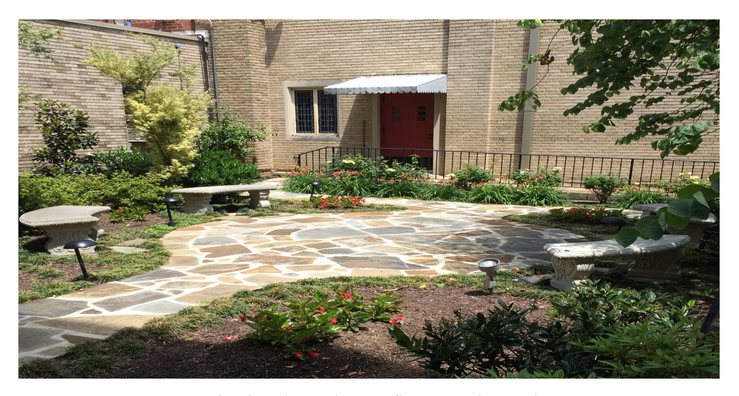
Our Chapel Garden. A place to reflect, pray or just to relax.