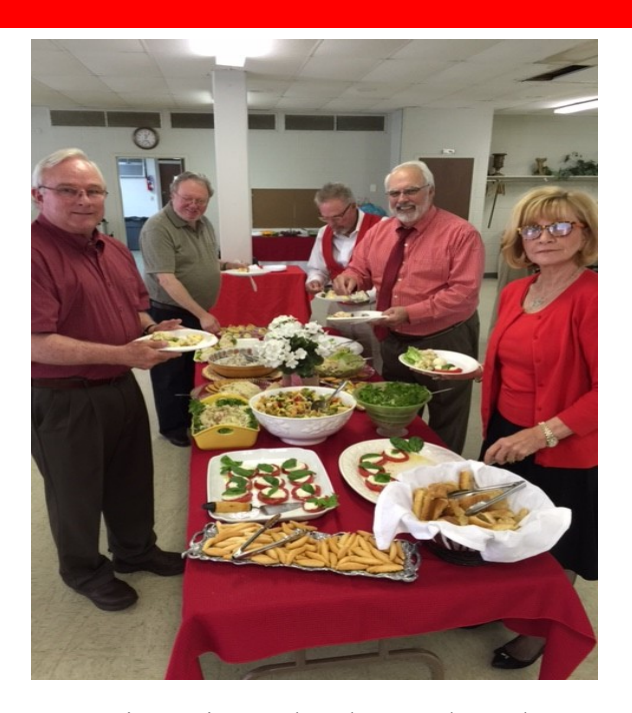
A picture is worth a thousand words!