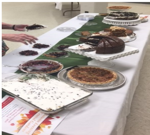
The dessert table