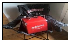
Photo on the left is a Stillhouse Cooler and an outdoor folding chair.