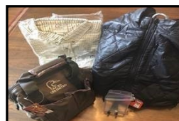
Photo on the left is a Ducks Unlimited bag, shirt, vest and waterproof phone case.

Photo on the right is Anna & Ava Sunglasses and case.