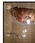
Left and right photos, deteriorating plaster ceilings in the gym showers. Center: “leak catchers”.