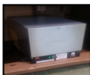
Left, the rusted hot water tank; Center, spot under the counter next to dishwasher; Right, the new “Booster Heater”.