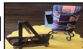
Photo on the right is Anna & Ava Sunglasses and case.

Photo on the left is a Ducks Unlimited bag, shirt, vest and waterproof phone case.