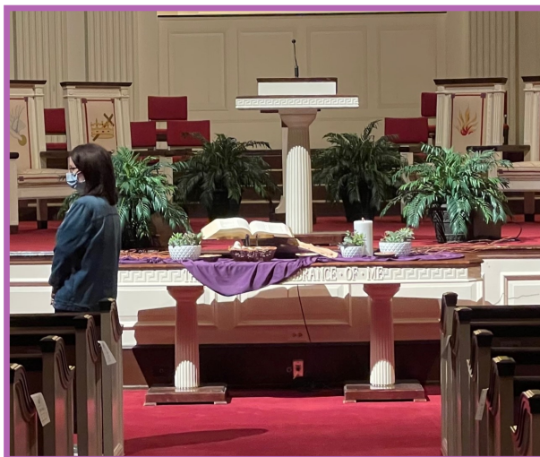
Above: Sanctuary at First Baptist Church

On Wednesday, March 2nd, members from Central Christian Church, as well as members from Kingsway Christian and Lindenwood Christian, celebrated Ash Wednesday along with members at First Baptist Church. Pastors from each church participated in the evening's service.