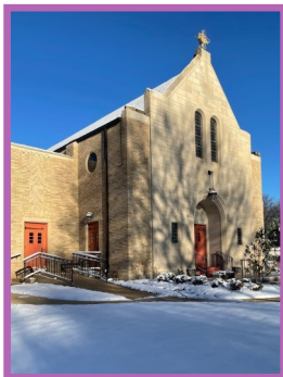
Early morning photo of Central on March 9th

On Wednesday, March 2nd, members from Central Christian Church, as well as members from Kingsway Christian and Lindenwood Christian, celebrated Ash Wednesday along with members at First Baptist Church. Pastors from each church participated in the evening's service.