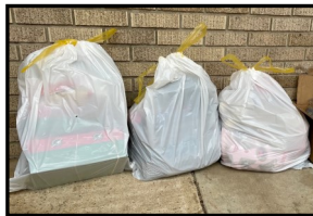
Newly Found Gifts