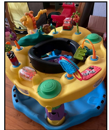
Photo of toys donated to the Spring '22 yard sale.

Also: Contract Bridge on Mondays and Fridays