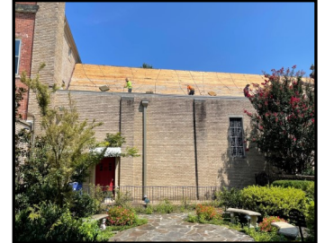
No longer a slate roof!

Early Monday morning, August 23rd, began a new era for members at Central Christian Church: A new Sanctuary roof! The old slate roof protected the church for approximately 75+ years. Now it was time for a new one. The photos above show the workers for ARK Roofing removing the slate roof down to the wooden deck. Note that the workers are literally “hanging on by a thread”; but in this case “a rope”. The old slate was unloaded in the dumpster - but several pieces of the slate were kept as part of the church’s history.